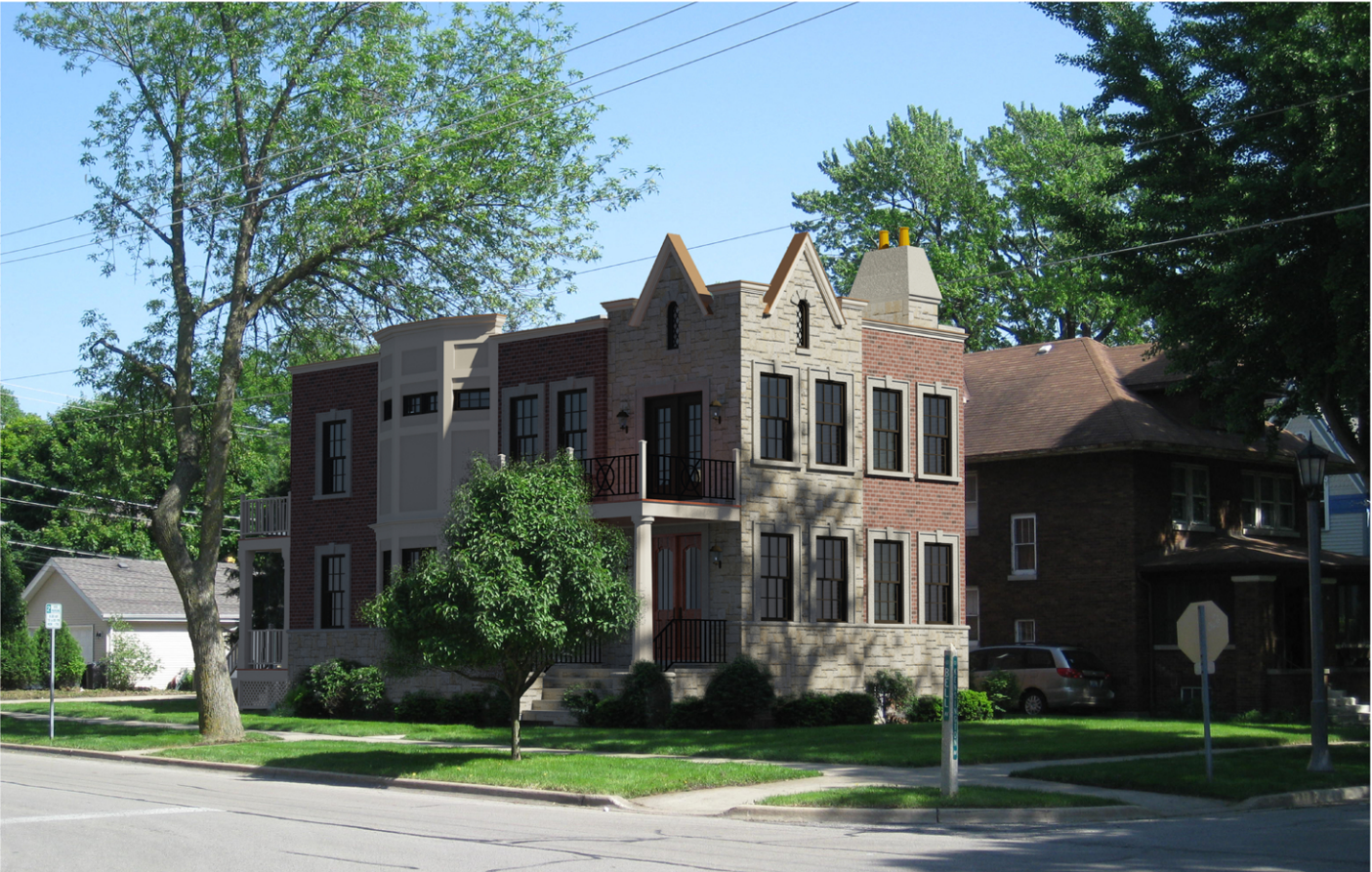
Proposed Facade Renovation